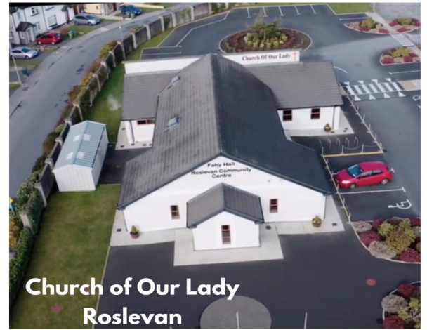
Church of Our Lady Roslevan