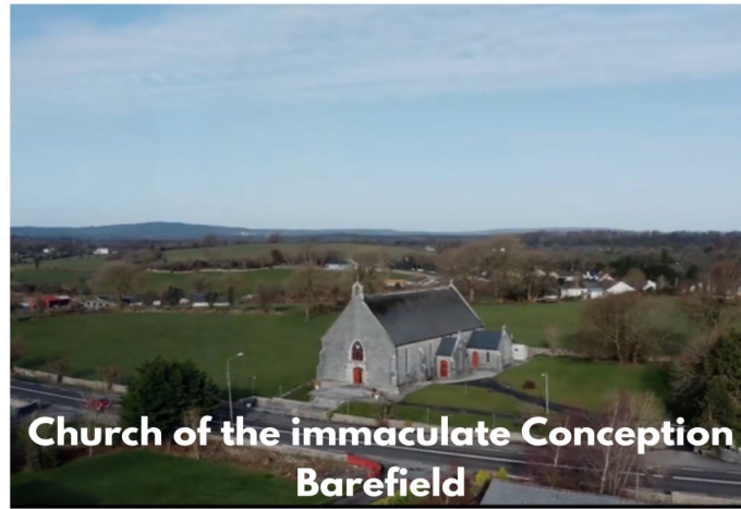
Church of the immaculate Conception Barefield