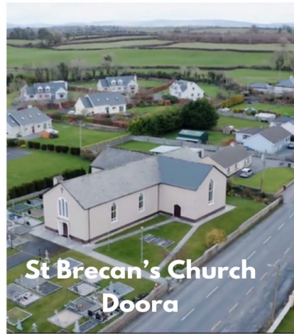
St Breacan's Church Doora